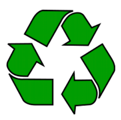
Thanks for recycling!!!!!